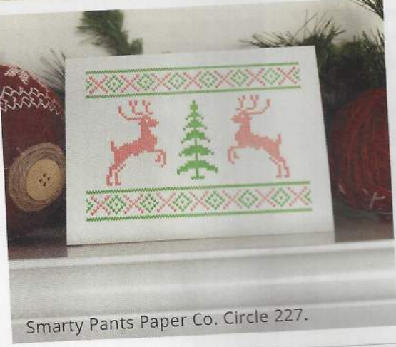
Smarty Pants Paper Co. Circle 227.