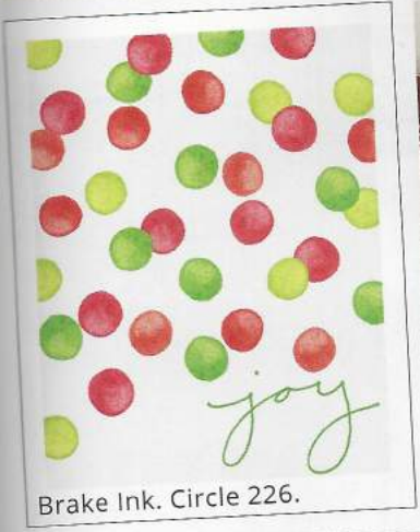
Brake Ink. Circle 226.