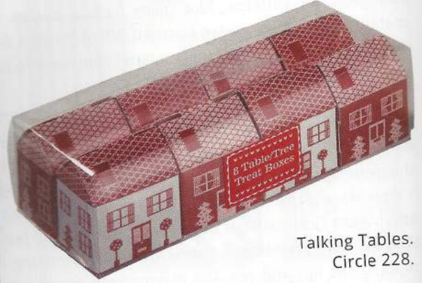
Talking Tables. Circle 228.