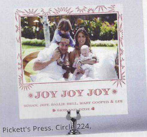
Pickett's Press. Circle 224.