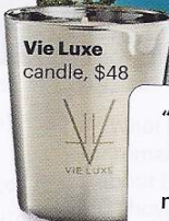
Vie Luxe candle, $48