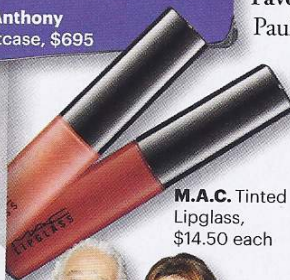
M.A.C. Tinted Lipglass, $14.50 each