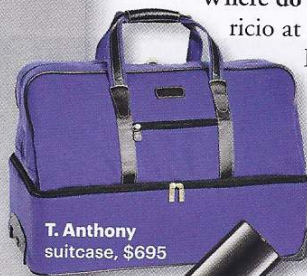
T. Anthony suitcase, $695