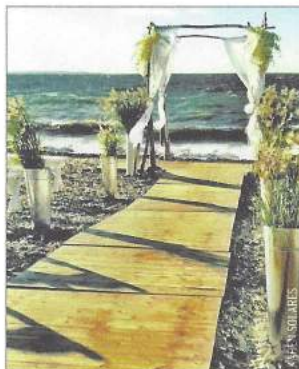
Navy Beach 631.668.6868 navybeach.com