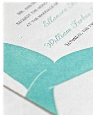
Pickett's Press 917.PICKETT (742.5388) pickettspress.com