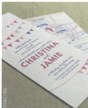
nane press 586.219.2192 nanepress.com