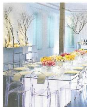
Taylor Creative Inc. 646.336.6808 taylorcreativeweddings.com