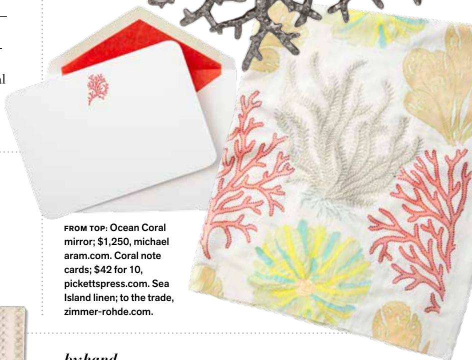
FROM TOP: Ocean Coral mirror; $1,250, michaelaram.com. Coral note cards; $42 for 10, pickettspres.com. Sea Island linen; to the trade, zimmer-rohde.com.

The design world's on-again, off-again relationship with one of its favorite motifs is suddenly back in swing. But the coral references we've been seeing lately have a fresh approach—ticked out in delicate embroidery on a subtly colored, unfussy linen; as rustic, rough-hewn twigs tendriling off a standout mirror (perfect for a foyer!); anchoring sophisticated correspondence cards with gently curved edges. They're a perfect way to introduce a quiet, beachy vibe at the height of summer.