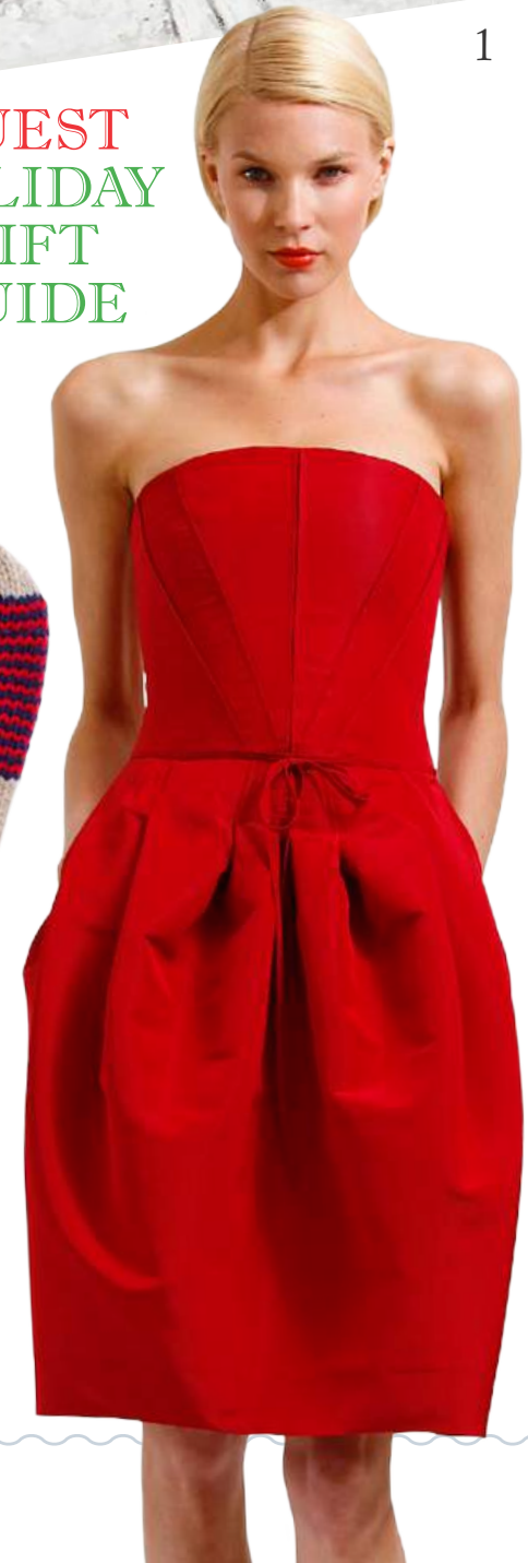
1. Antoine Blanchard's "Les Grands Boulevards et La Porte Saint-Denis" oil painting at Wally Findlay Galleries: 212.421.5390. 2. Ralph Lauren Blue Label's shawl wrap cardigan sweater. $598: ralphlauren.com. 3. Jack Spade Crews mittens. $85: jackspade.com. 4. Cheer up in Carolina Herrera's red silk faille strapless dress. $2,290: 212.249.6552. Opposite page: 1. David Yurman's 18-kt. white gold Starburst necklace. Price upon request: 212.752.4255. 2. Belgian Shoes's Midinette in zebra print. $350: belgianshoes.com. 3. Montblanc's Tribute to Mont Blanc Collection cufflinks in steel and onyx. $415: montblanc.com.