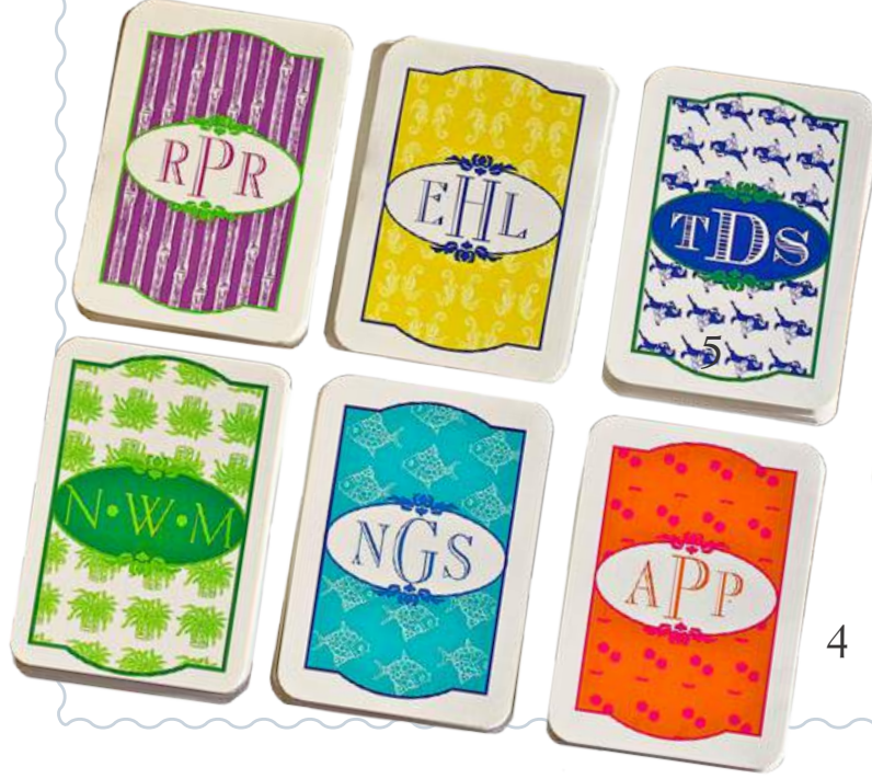
1. Perk up morning coffee with Kate Spade's "Make Headlines" mugs. $25 each: bloomingdales.com. 2. A bespoke discovery of New York awaits with The Surrey Hotel's "Luxury on Madison" shopping packages. From $520: thesurrey.com. 3. Sequin's signature hinged enamel cuffs. $35-95: 561.328.8405. 4. Give a playful gift with monogrammed playing cards from Pickett's Press. $75: pickettspres.com. 5. Brighten up your room with Dana Gibson's Multi Ikat chair (42" high; $750) and Emperor Pillow (23" square; $175): danagibson.com.